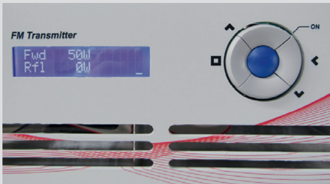
▲ Display and control keys