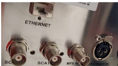
▲ Rear panel detail