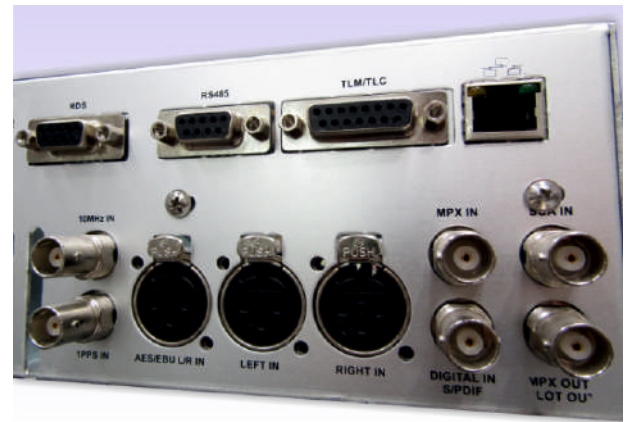
▲ Rear panel detail