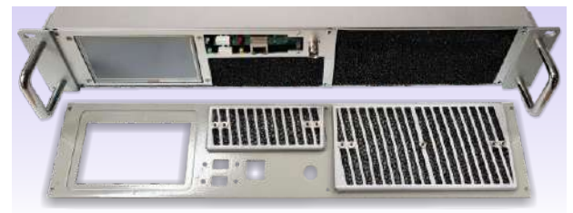
▲ Front panel filter protection