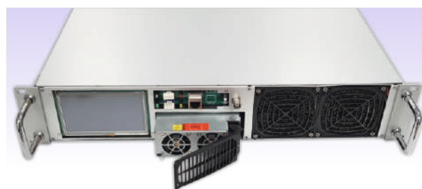
▲ Front panel details