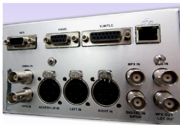
▲ Rear panel detail